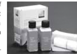
Unifers Leather MASTER Leather care kit

The Leather MASTER (leather care kit) consists of a cleaner for cleaning and protecting without deteriorating the texture of leather, and a protection cream for not only protecting from soiling but also giving leather moisture and oil. Applying the protection cream before using our leather products provides protection from soiling through everyday use.