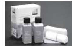
Unifers Leather MASTER Leather care kit

The Leather MASTER (leather care kit) consists of a cleaner for cleaning and protecting without deteriorating the texture of leather, and a protection cream for not only protecting from soiling but also giving leather moisture and oil. Applying the protection cream before using our leather products provides protection from soiling through everyday use.